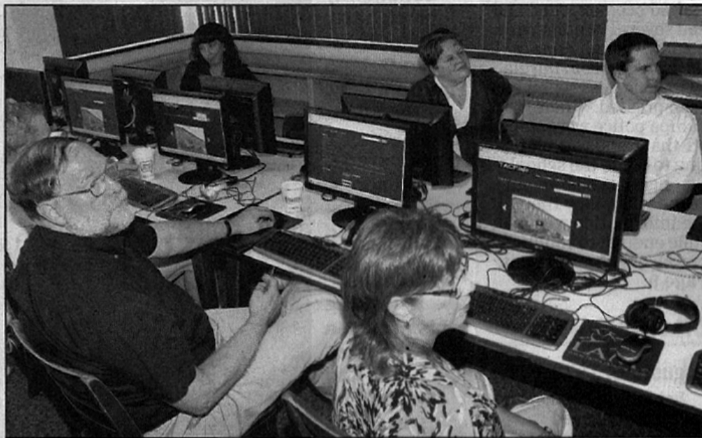
Visitors and TACP members sit through the open house as they learn the benefits of the new partnership website.